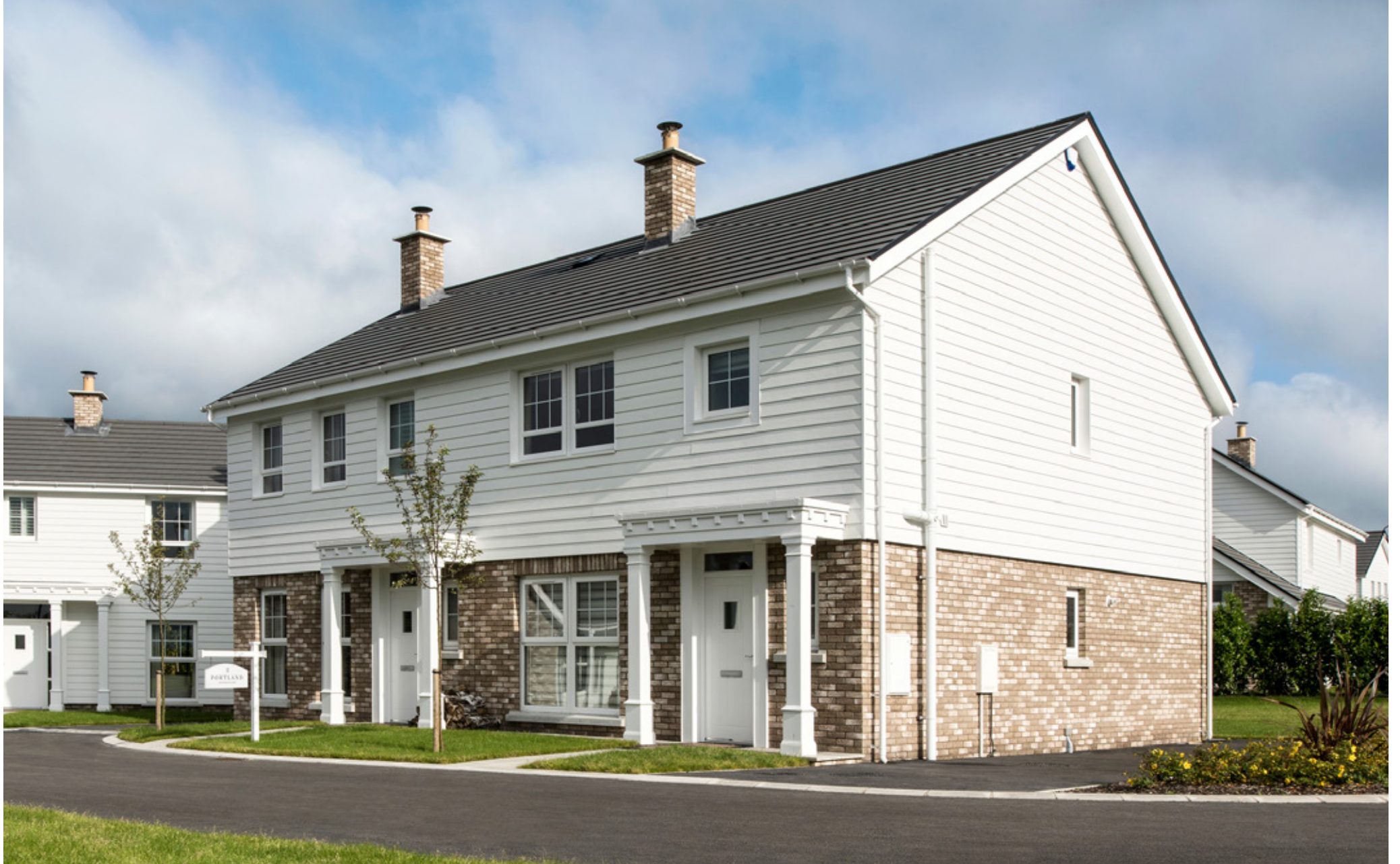
PORTLAND | 3 Bed Semi-Detached